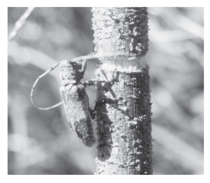
Figure 1. Twig girdler.